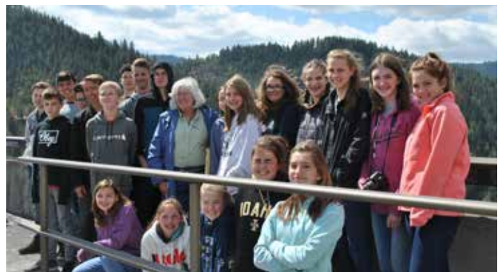
Class photo atop Dworshak Dam.