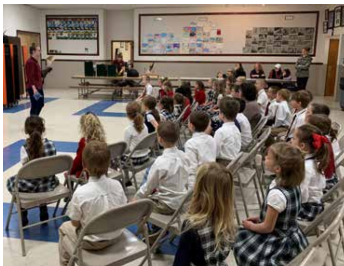
What fun to have the WSU Raptor Club 'show and tell' about birds of prey to the kindergarten classes.