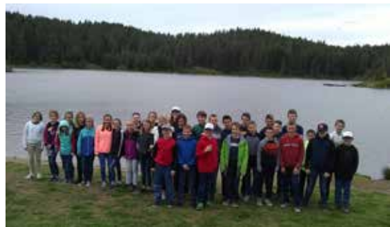
Above: The annual Spring Valley Reservoir adventure for the sixth grade classes.