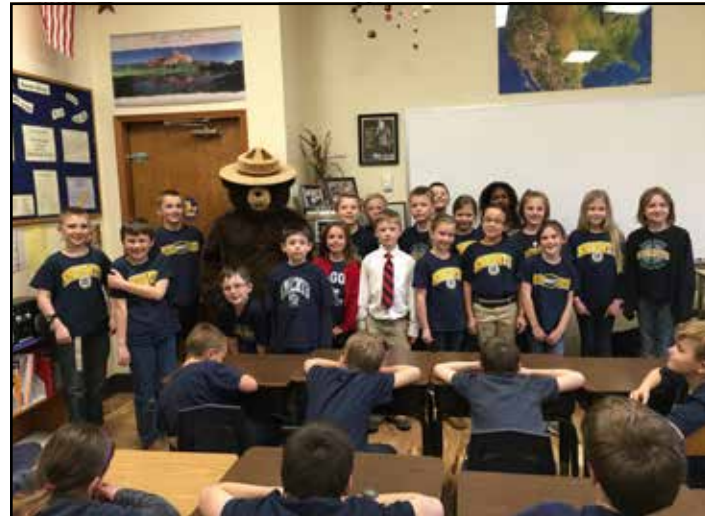
Third graders pose with Smokey Bear who visited on March 24 with a fire safety lesson.

be on display at the Latah County Library throughout May. Pleiades, established in 1892, is the oldest Idaho women's club in continuous existence.