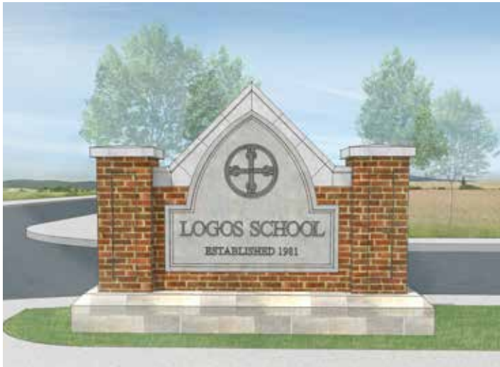
The "Fund-A-Need" segment of the LIVE auction raised $17,000 for a monument sign that will mark the entrance of the new campus.

Other major sponsors included: Canon Press, Carlton Builders, Carpet Mill, CHS Primeland, Gritman Medical