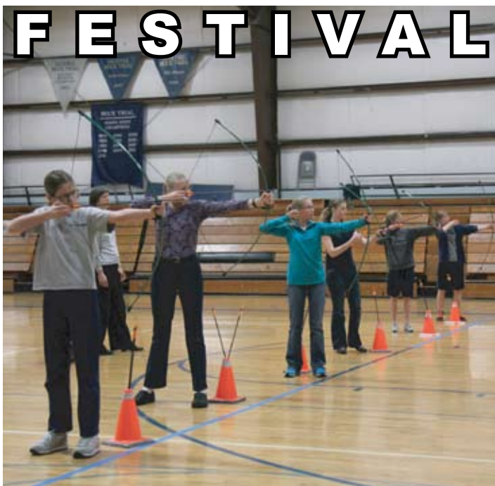
Ladies take aim in the lower division archery contest.