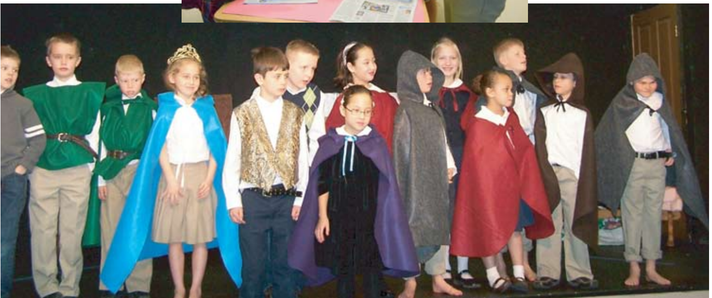
The second/third combo class takes a bow after performing "Elizabeth of Hungary."