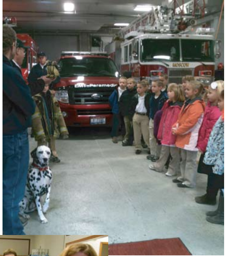
The annual fire station field trip teaches first graders safety.