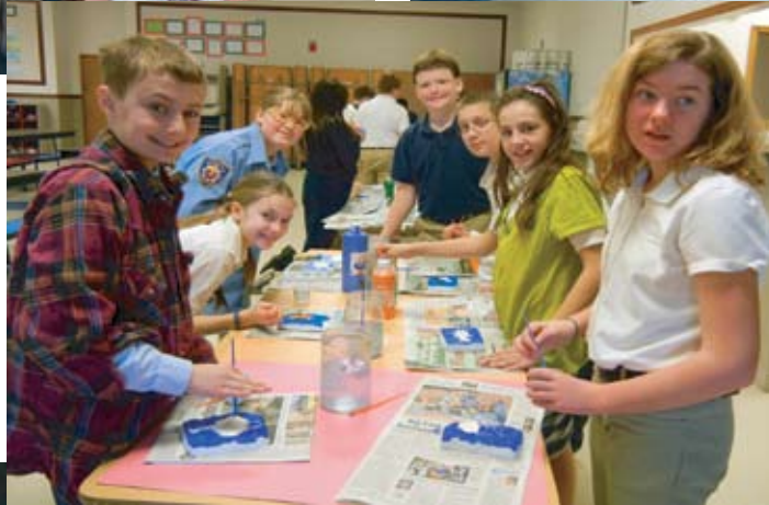
At right, the fifth grades paint their plaster reliefs of ocean creatures.