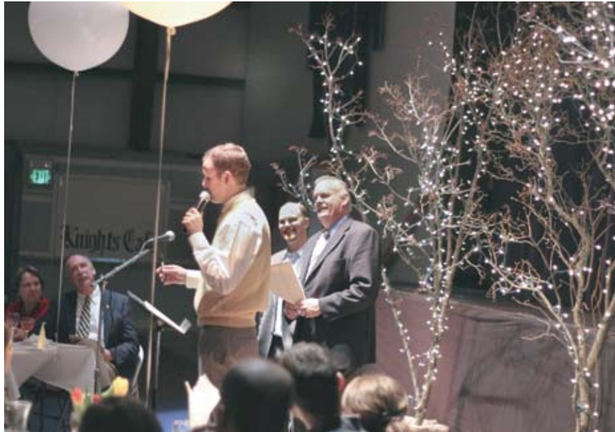
A professional auctioneer kept the bids climbing during this year's Friends of Logos Benefit Auction.