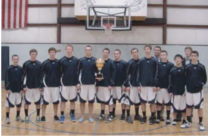
Mountain Christian League Champions.