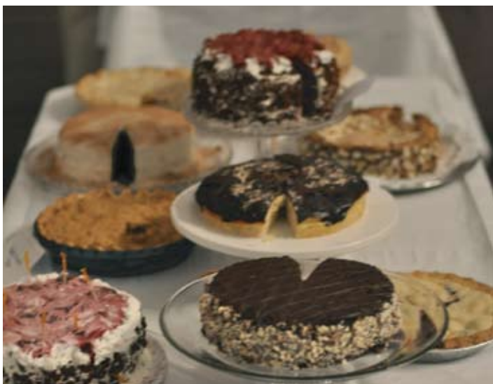
Fabulous student dessert creations from the baking contest filled four tables.