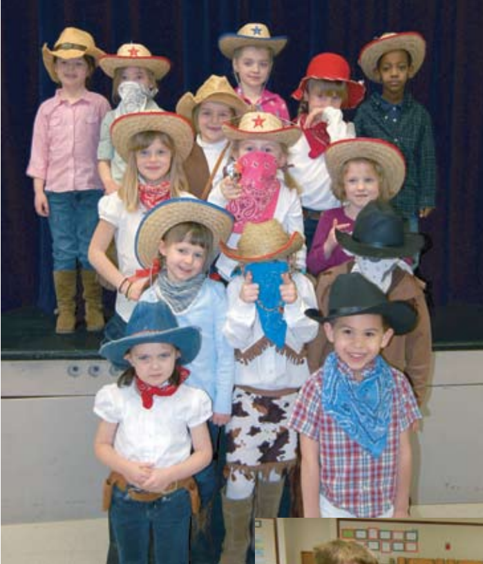
The kindergartners dressed up for Cowboy Day.