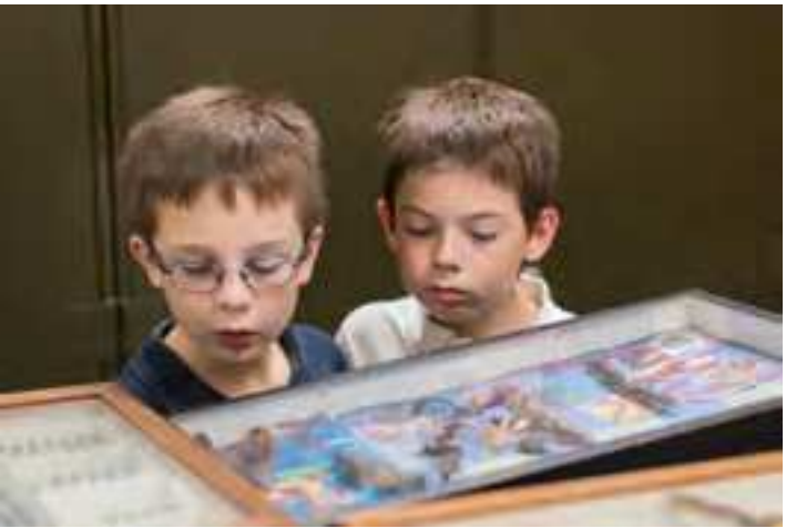
Fourth graders learned about bugs at Washington State University during the annual entomology field trip.