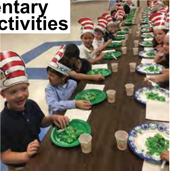
First graders enjoy green eggs and ham.