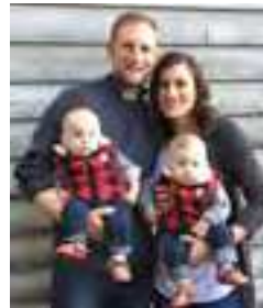
The Bouma Family