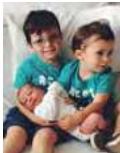
The Kohl brothers