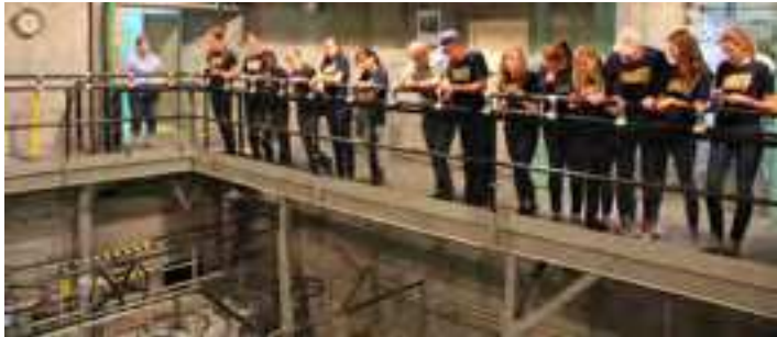
Deep inside Reactor B (looking down at the cooling water pumps that feed the reactor).