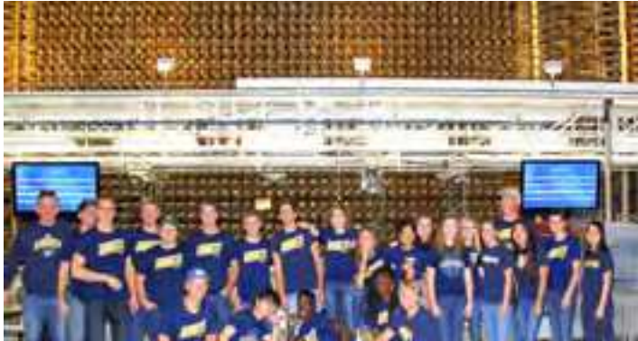
In front of the reactor core.