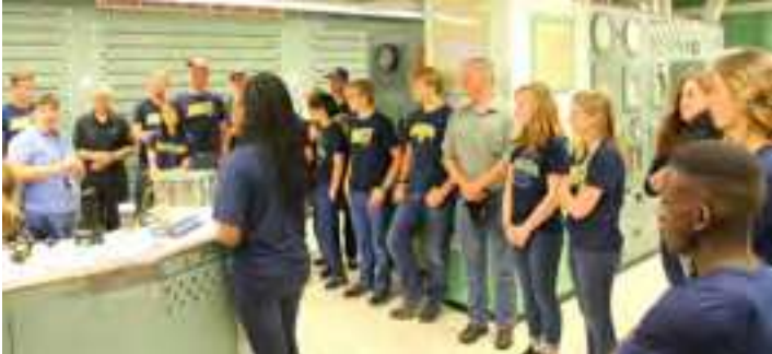
The control room for Reactor B.

Commended Students are named on the basis of a nationally applied Selection Index score that may vary from year to year and is typically below the level required for participants to be named Semifinalists in their respective states.