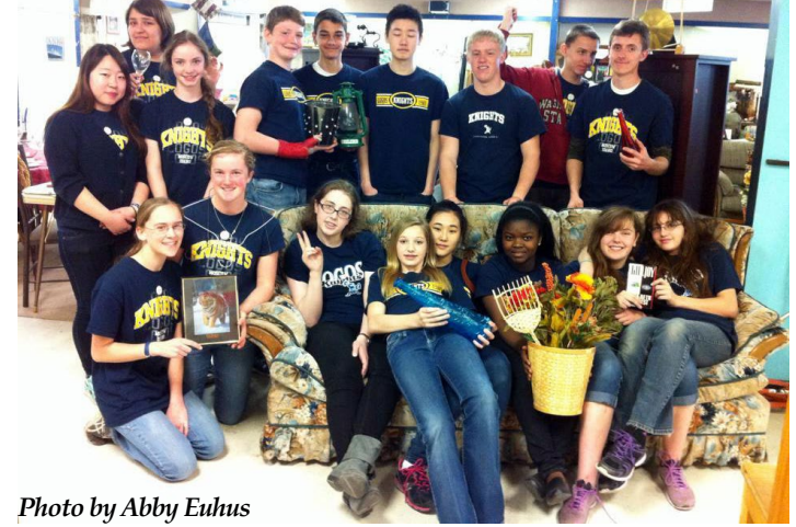
Students worked at various local organizations like the Salvation Army.

Following lunch, the championship rounds for basketball, volleyball, archery, and chess were battled out. When the court was cleared of volleyball nets, the real struggle began with